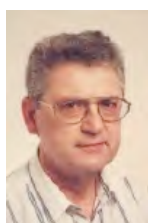
OOTC EUROPEAN DIRECTOR AT LARGE #3384 DJ2XB