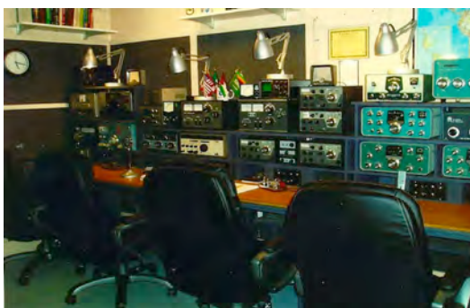
W9QR #3916 7/22/2010