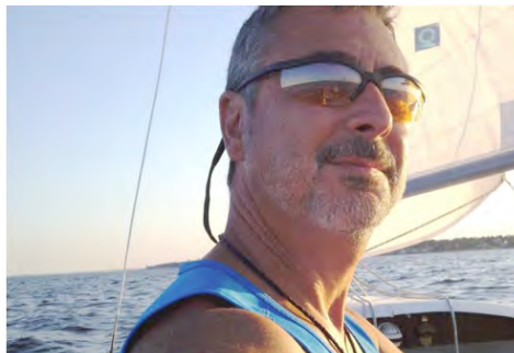
Fair Winds, Following Seas and See U on the RADIO!!!